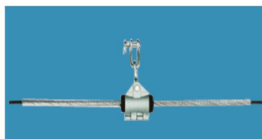
SAXD-150-XX suspension clamp